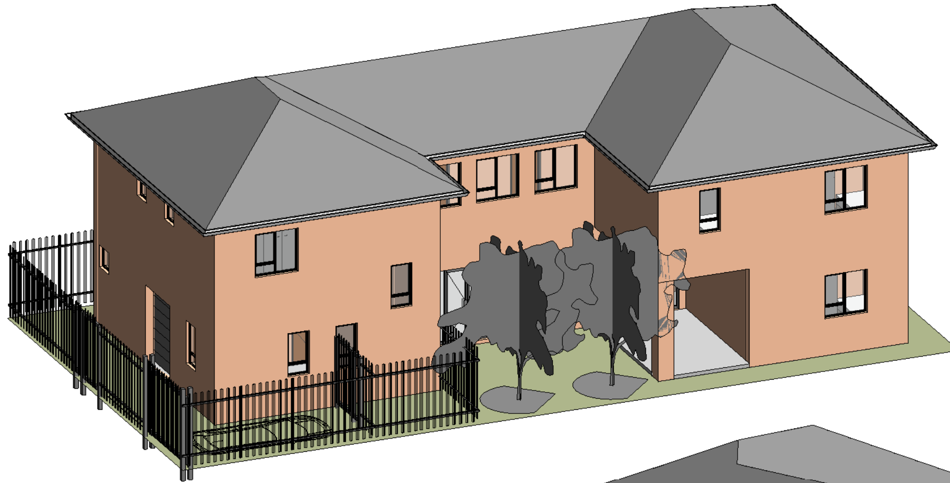
1 3 D View 1